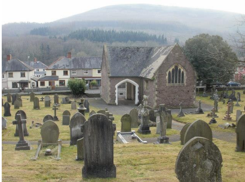
Risca Old Cemetery

Risca Old Cemetery, Risca, Monmouthshire, Wales contains 25 Commonwealth War Graves – 20 relating to World War 1 & 5 from World War 2.